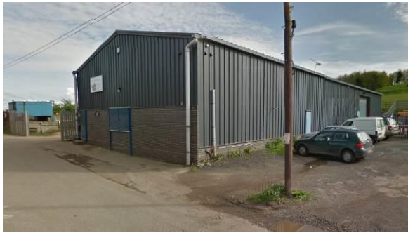
Photograph 2: Building B1 along the sites northern boundary